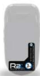
Samsung SCH-U360 Position on Back Lower/Center