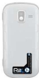
Samsung Intensity III Position on Back Bottom/Center