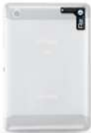
Samsung Galaxy Tab 7 Position on Back Top/Right (cellular SG, 4G and other models)