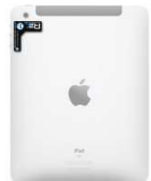
iPad Position on Back at Top/Left (cellular 3G, 4G and other modes)