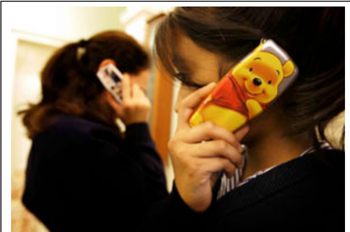
No child's toy: warnings from the National Radiological Protection Board suggest that children are at greater risk of harm when using their mobile phones