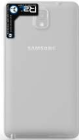
Samsung Galaxy Note 3 Position on Back Upper/Left