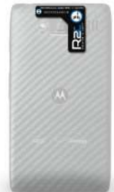
Motorola Droid Razr HD Position on Back Upper/Center