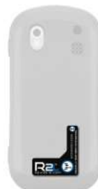
Samsung Intensity II Position on Back Bottom/Center