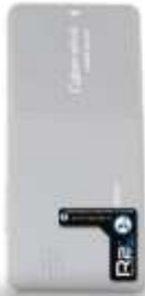
Sony Ericsson C510 Position on Back Bottom/Right