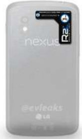
Google Nexus 4 Position on Back Upper/Right