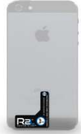
iPhone 5 Position at Bottom/Center