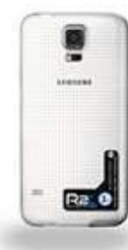
Samsung Galaxy S5 Position on Back Lower/Right