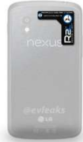
Google Nexus 4 Position on Back Upper/Right