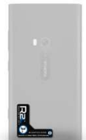
Nokia Lumina 920 4G windows phone Position on Back on Bottom/Left