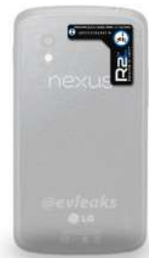
Google Nexus 4 Position on Back Upper/Right