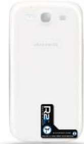
Samsung Galaxy S3 Position on Back Bottom/Right