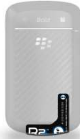
BlackBerry Bold 9930 Position at Bottom/Center and Slightly Wrap-around Bottom