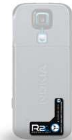
Nokia N5000 Position on Back Bottom/Center