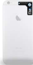
iPhone 6 Plus Position on Back Upper/Right