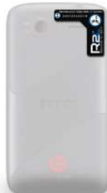
HTC Sensation XE Position on Back Upper/Right