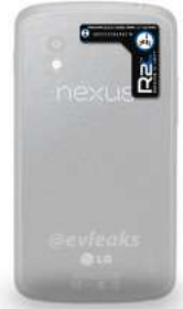
Google Nexus 4 Position on Back Upper/Right