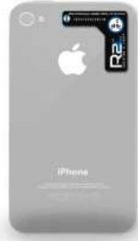
iPhone 4S Position on Back Upper/Right