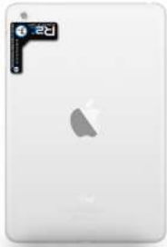
iPad Mini Position on Back at Top/Left (cellular 3G, 4G and other modes)