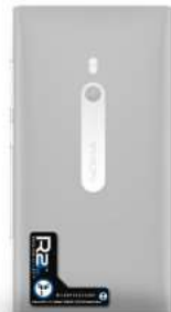
Nokia Lumia 800 Position on Back on Bottom/Left