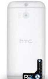
HTC One M8 Position on Back Lower/Right