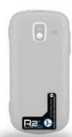
Samsung SCH-u485 Position on Back Bottom/Center