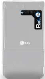
HTC Sensation XE Position on Back Upper/Right