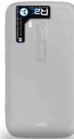
Nokia-lumia-822 Position on Back at Top/Left