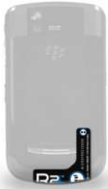
Blackberry 8830 Position at Bottom/Center and Slightly Wrap-around Bottom