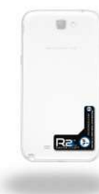
Samsung Galaxy S4 Position on Back Lower/Right