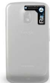
Samsung Galaxy Nexus Position on Back Upper/Right