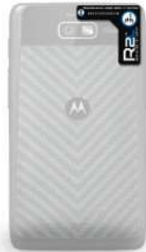
Motorola Droid Razr M Position on Back Upper/Right