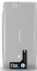
Sony Xperia Arc Position on Back Bottom/Center