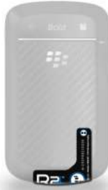
Blackberry Bold 9930 Position at Bottom/Center and Slightly Wrap-around Bottom