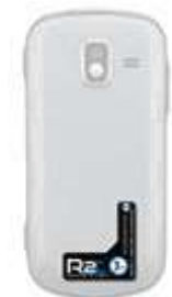
Samsung Intensity III Position on Back Bottom/Center