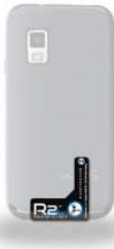
Samsung Galaxy S Position on Back Lower/Center