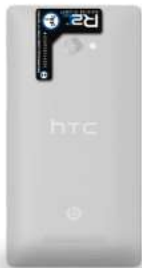
HTC Windows Phone 8X Position on Back Upper/Center