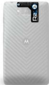
Droid Razr MAXX HD Position on Back Upper/Center