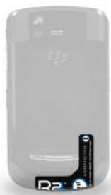
Blackberry 8830 Position at Bottom/Center and Slightly Wrap-around Bottom

Erchonia has put a list of cell phones together to help you and your family place the R2L Phone Protectors in the correct position for maximum RF reduction ( as close to the antenna as possible ). If your phone is not listed below, please use the following video to locate the correct positioning on your phone: R2L Training ~ How to place the R2L on your cell phone.