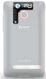
HTC EVO™ 4g Position on Back Upper/Center