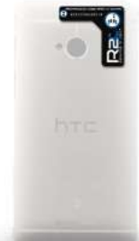
HTC One Position on Back Upper/Right