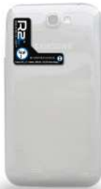
Samsung Note 2 Position on Back Top/Left