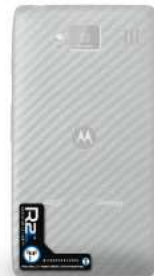
Motorola Droid Razr Position on Back Lower/Left