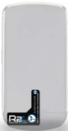
LG UX5600 Position on Back Lower/Center