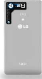
LG Lucid2 (VS870) Position on Back Upper/Left