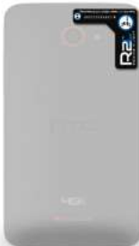
HTC Droid DNA Android Position on Back Upper/Right