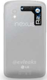
Google Nexus 4 Position on Back Upper/Right