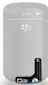
Blackberry Bold 9930 Position at Bottom/Center and Slightly Wrap-around Bottom