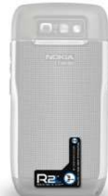
Nokia E71-1 Position on Back Lower/Center