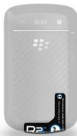
Blackberry Bold 9930 Position at Bottom/Center and Slightly Wrap-around Bottom