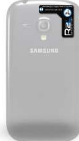
Samsung Galaxy S3 Position on Back Upper/Right