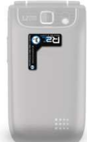
Nokia 3610a Position on Back Under Camera