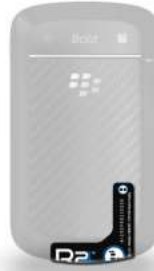
Blackberry Bold 9930 Position at Bottom/Center and Slightly Wrap-around Bottom