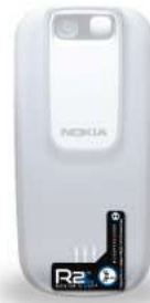
Nokia 2680a-2 Position at Bottom/Center